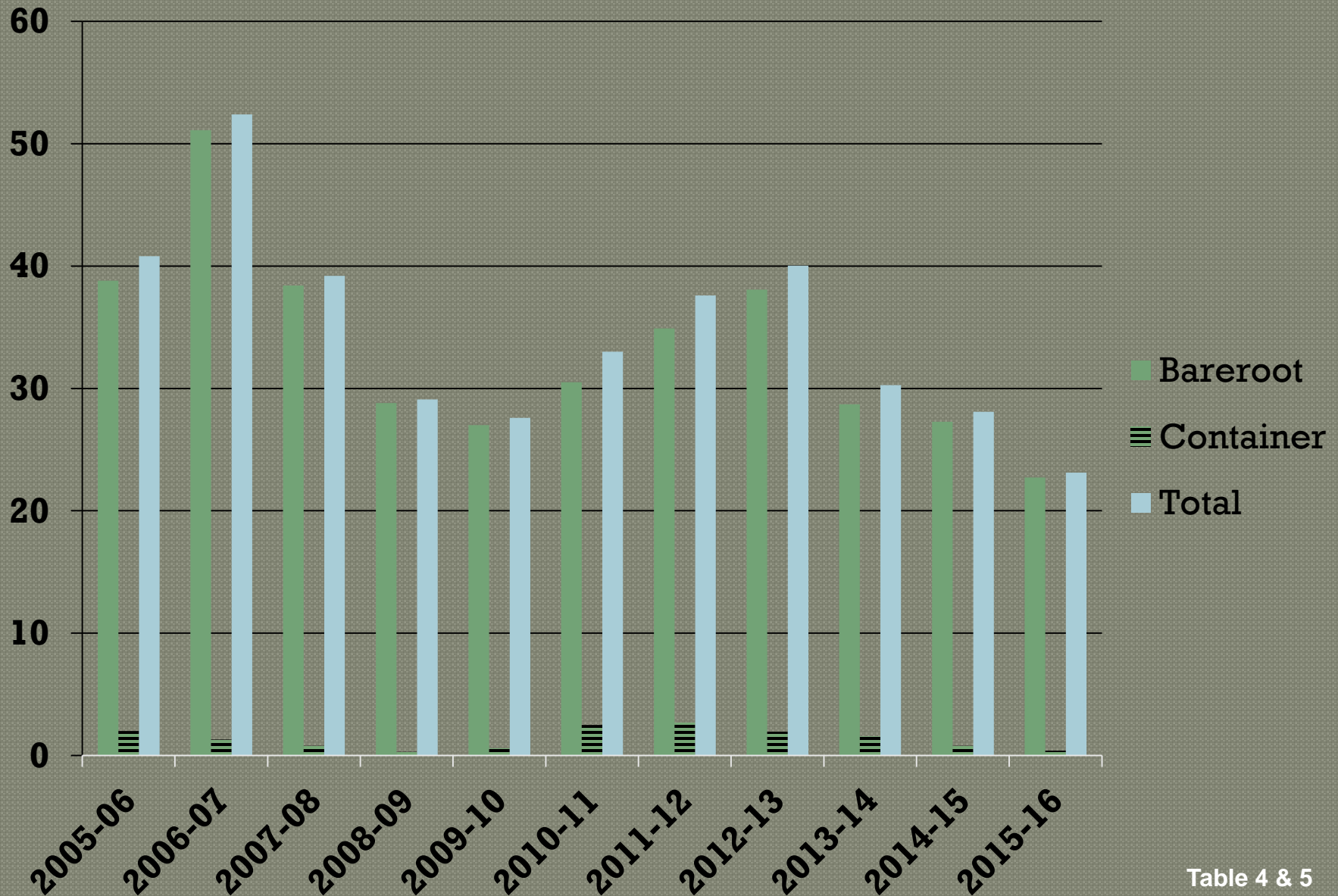
Table 4 & 5